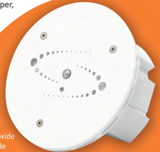
*HALO IOT Smart Sensor - Patent Pending*

HALO's Air Quality Index(AQI) will alert when air quality levels fall in the danger zone for spreading disease, reducing the spread of virus particulates and regularly monitoring to align with industry and government standards.